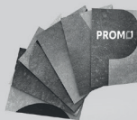
Graphic Panels (12 pcs.)