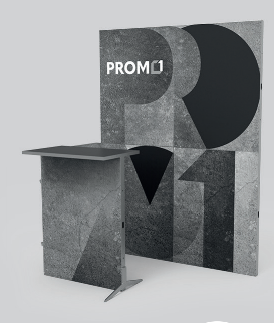
Price: 11 899,00 AED netto